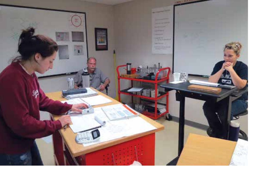
A Daman trainer (center) mentors a trainer-in-training (right) as she trains an employee to inspect products.

we understand the value of our customers' participation in our new product ideas. We are learning to see what works, and how to build our business by making more of what customers really want and by making things better for them."