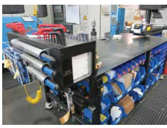
This workbench was customized by the Continuous Improvement department to reduce clutter and organize tools in order to streamline productivity.

Yet calling on employees who had traditionally worked in functional areas outside of marketing to participate in the new creative team initially drew skepticism from some of the selected team candidates. "We were asking people to work together, outside their comfort zones and traditional roles," said Weiler. "We wanted a better NPD pro-